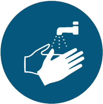
Health & Hygiene